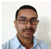
By: M.R. Lahu

them into relentless suffering and persecution and suppression. The Islamic morality police and its intervention in people's life seem to have gone beyond an acceptable limit. India did not debate this important development of Iran. There is a visible reluctance in our country to bring the topic for a sensible discussion. Everybody is conveniently silent on the impact of Islamic radicalisation and a revolution seeking progress and liberation in a country which considers women as veiled creatures. Amini is a symbol and the Iranian outrage is a message that the world should actually be cognizant of. With its reach in essence and practice across the globe, the world's second largest religion poses certain significant questions when its rigidity becomes abhorrent and dishonest. The first one is, how long any administration would fight back human aggression against the spiritual madness of religions. Will clamping down on the internet and clashing with the outrageous public cure the real malady that the society is infested with? Why are some religions unable to bring credible, viable and visible humanitarian amendments in their religious ethos? How long should the world suffer these unprincipled ways of patriarchal interventions?